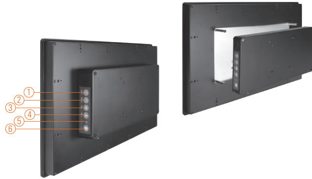
▲ Modularized design